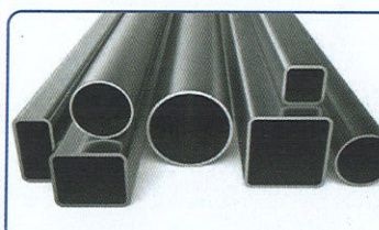
ERW MS PIPES AND GP PIPES